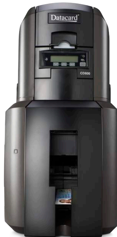
Datacard® CD800™ Card Printer with inline lamination module