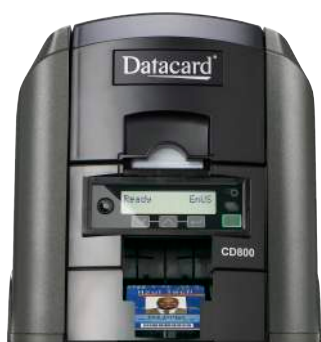
Datacard® CD800™ Series Card Printer