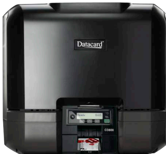
Datacard® CD800™ Card Printer with optional multi-hopper